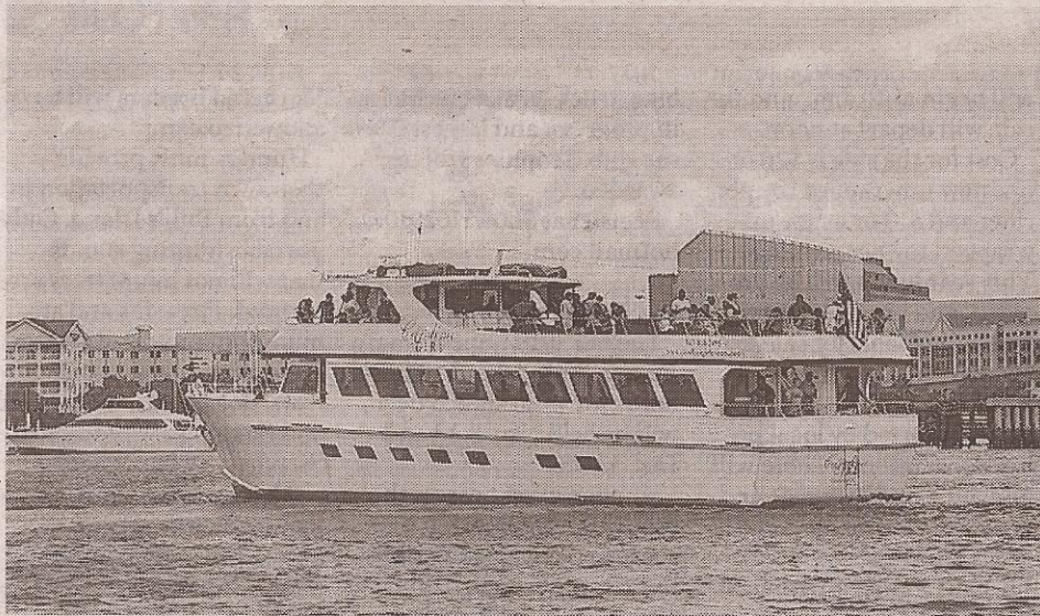
The Carolina Girl yacht recently hosted children from the Epworth Home.